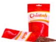
Chiatah Chia Seeds