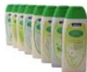
Melrose Nature's Herbs Range